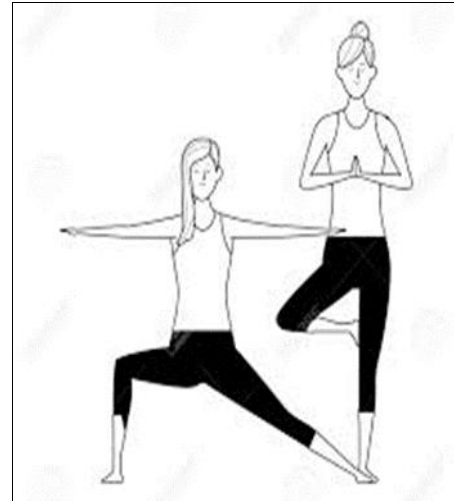
Fig 2: Benefits of Yoga during Pregnancy